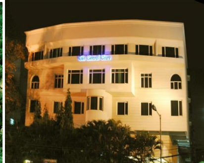
The Central Court