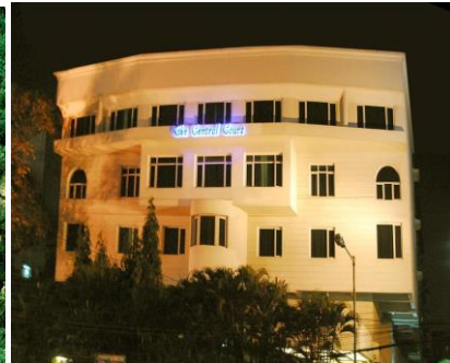
The Central Court